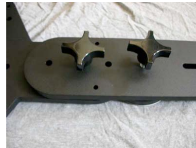
This image shows the plates together.