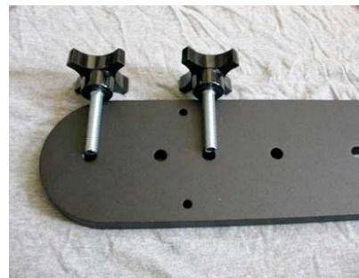
For wide spreader setting, insert knob threads through holes shown above.