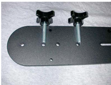
This is the knob setting for standard tripod and assembly.

First, make sure the configuration of the legs is always ABC counter clockwise (or the dolly charts will not be accurate and you will get erratic results when dialing in degrees), and that plates on dolly body are facing down or away from the leg extensions (or the faces of the degree plates will get scratched and the knobs will not secure the leg extensions to the dolly body as securely).